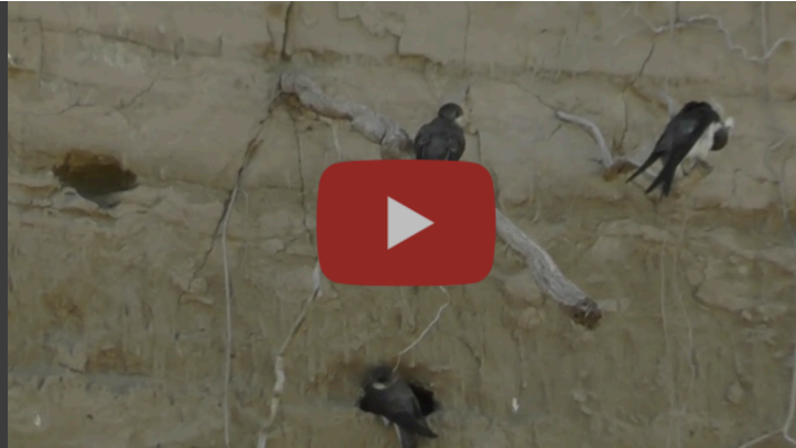
Bank Swallows at Fall River Mills Ecological Preserve

than brave the North Spit Jetty at Humboldt Bay, with now high winds and high tide, we moved to Trinidad Harbor where I picked up two lifers, the Harlequin Duck and the Pigeon Guillemot! We ended the day with a short walk around Potawot Health Village where we picked up a Chestnut-backed Chickadee and Orange-crowned Warbler. Thanks to all for a special birding day!